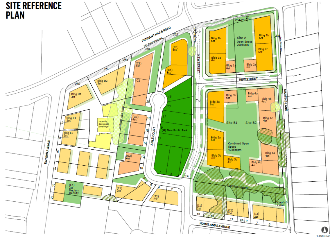
Figure 3– Reference Plan as per the Draft Carlingford Block Study 2017